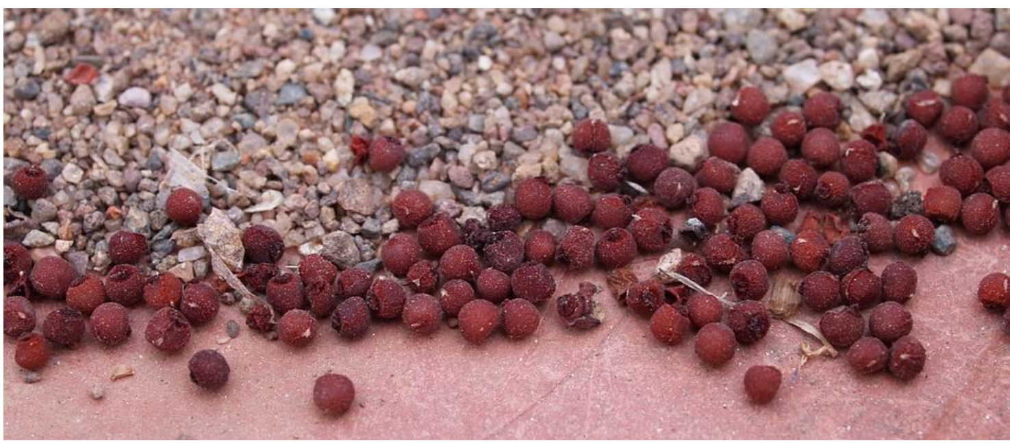
Crocus laevigatus seeds

I have tried sowing these seeds in the autumn but they have never germinated before the following spring. I suspect they need a cold period to trigger germination.