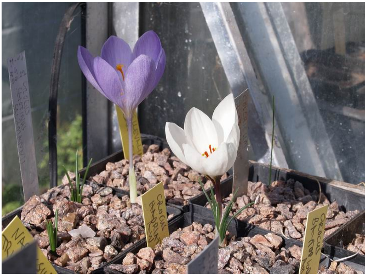
Crocus serotinus salzmannii and Crocus hadriaticus

Crocus species are still appearing and above are Crocus serotinus salzmannii and a beautiful dark purple-tubed form Crocus hadriaticus – both received from SRGC forumists in recent years.